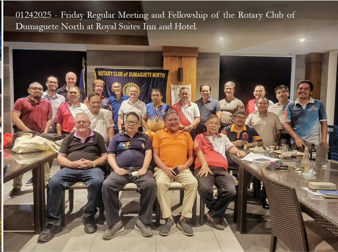
01242025 - Friday Regular Meeting and Fellowship of the Rotary Club of Dumaguete North at Royal Suites Inn and Hotel.